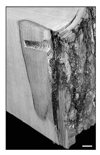
Figure 3. Stem injury from Arborjet injection in dissected sugar maple. Note the wound initiated discoloration and the imidacloprid residue. Scale bar = 10 cm.

Figure 2. Stem injury from Wedgle injection in dissected white ash. (A) External view of injection site with "arborcheck" plug. (B) Reverse surface of (A) showing plug, killed inner bark, and imidacloprid residue. (C) Stem surface beneath the bark showing the area of cambial dieback, woundwood formation, and imidacloprid residue. Scale bars = 5 mm.